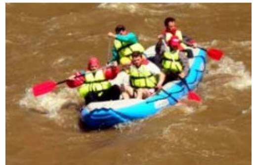
Rafting on Bistrita river

Dinner and accommodation in a 3*** hotel in the centre.