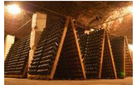
Urlati wine cellars